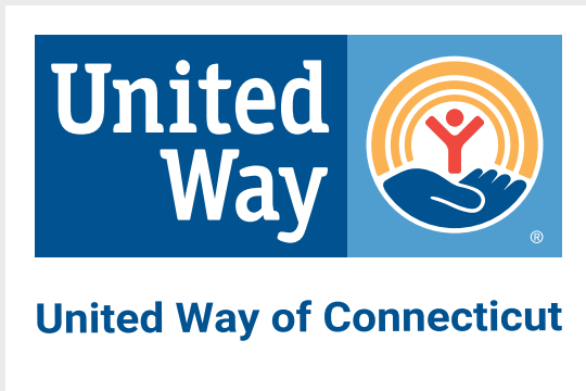
Vertical Mark (Primary Brandmark)