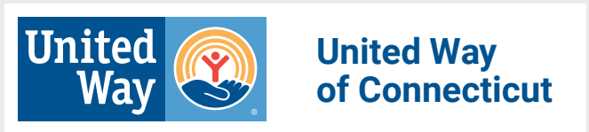
Horizontal Left and Right Marks (for small logo use cases under 2 inches)