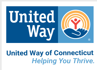
Logo with Thrive Tagline